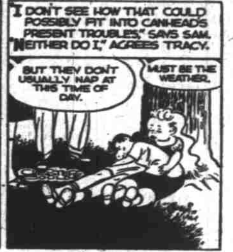
By DARRELL McCLURE