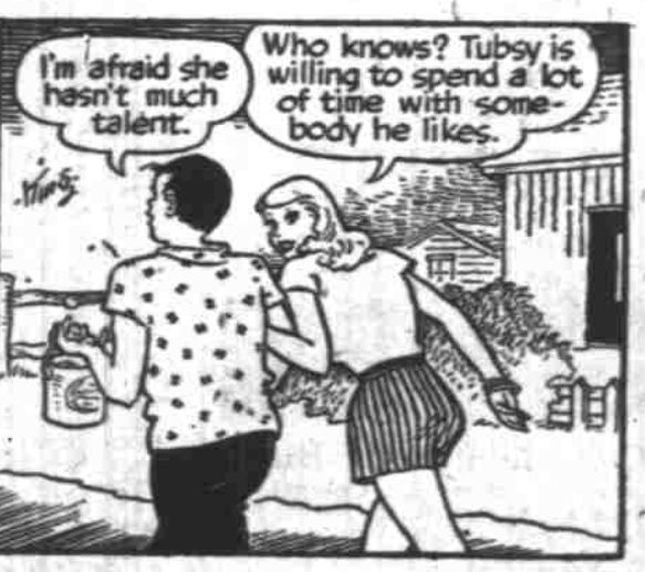
By FRED LASSWELL