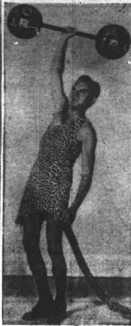
Spike Jones poses for a "Man of Muscle" photo as proof of his physical ability. His musical ability will be on display at the Capitol Theater Monday when he brings his 35-member "Musical Insanities" stage show for two performances, at 7:00 and 9:30. Reserved seats are now available at the Capitol Theater.