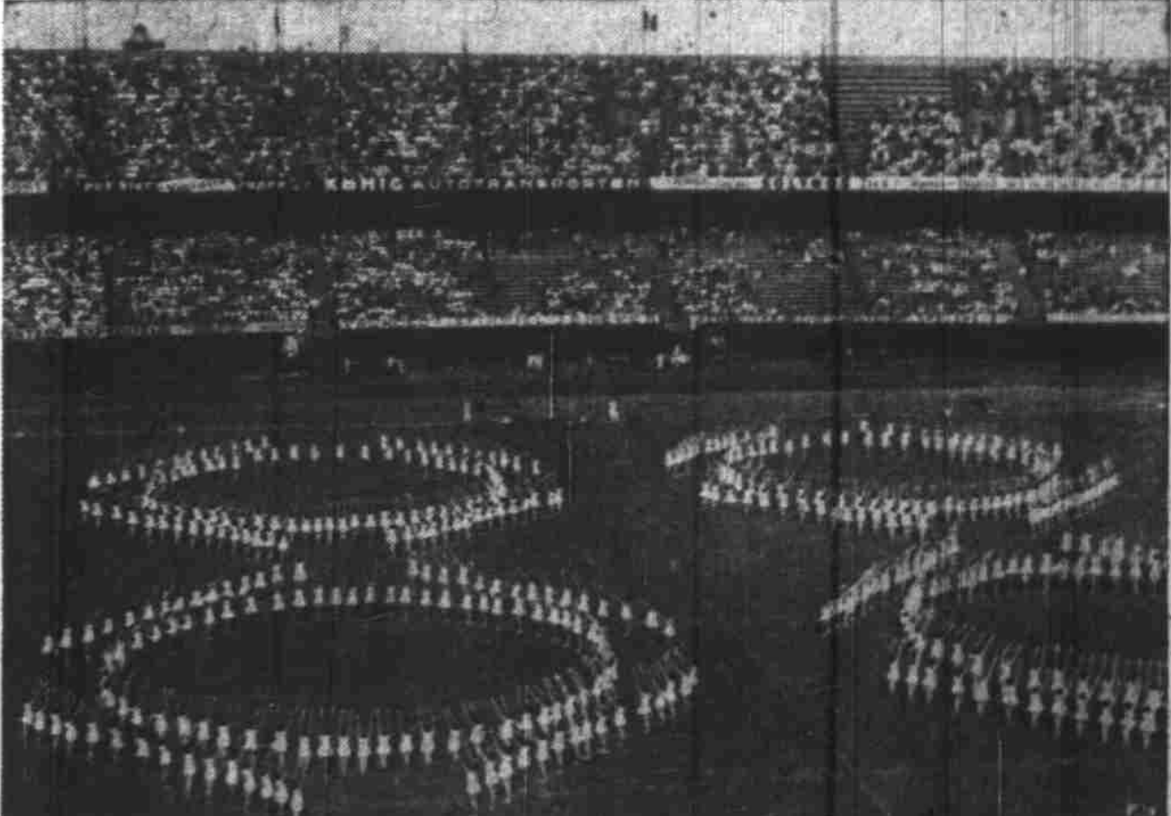
GYMNASTRADA —Dutch women provide the final display in Feyenoord Stadium, Rotterdam, on last day of Gymnastrada in which gymnasts from 14 European countries appeared.