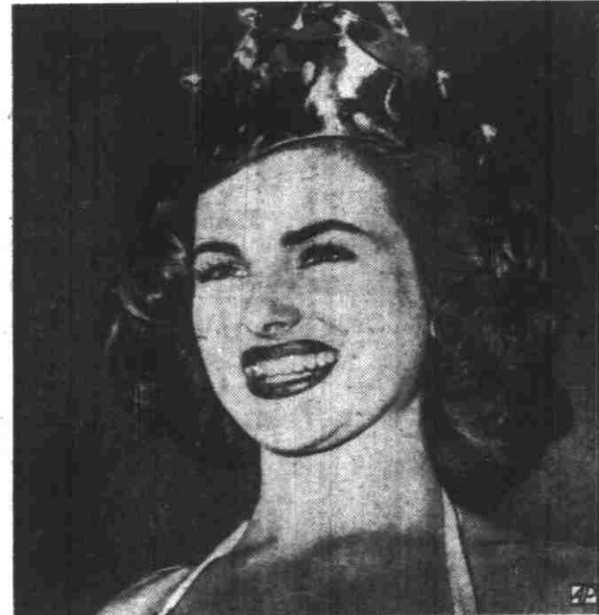
'MISS UNIVERSE' —Christiane Mariel, a brunette with blue-gray eyes, shows her best smile after crowning as "Miss Universe" at Long Beach, Cal. She's working now in the movies.