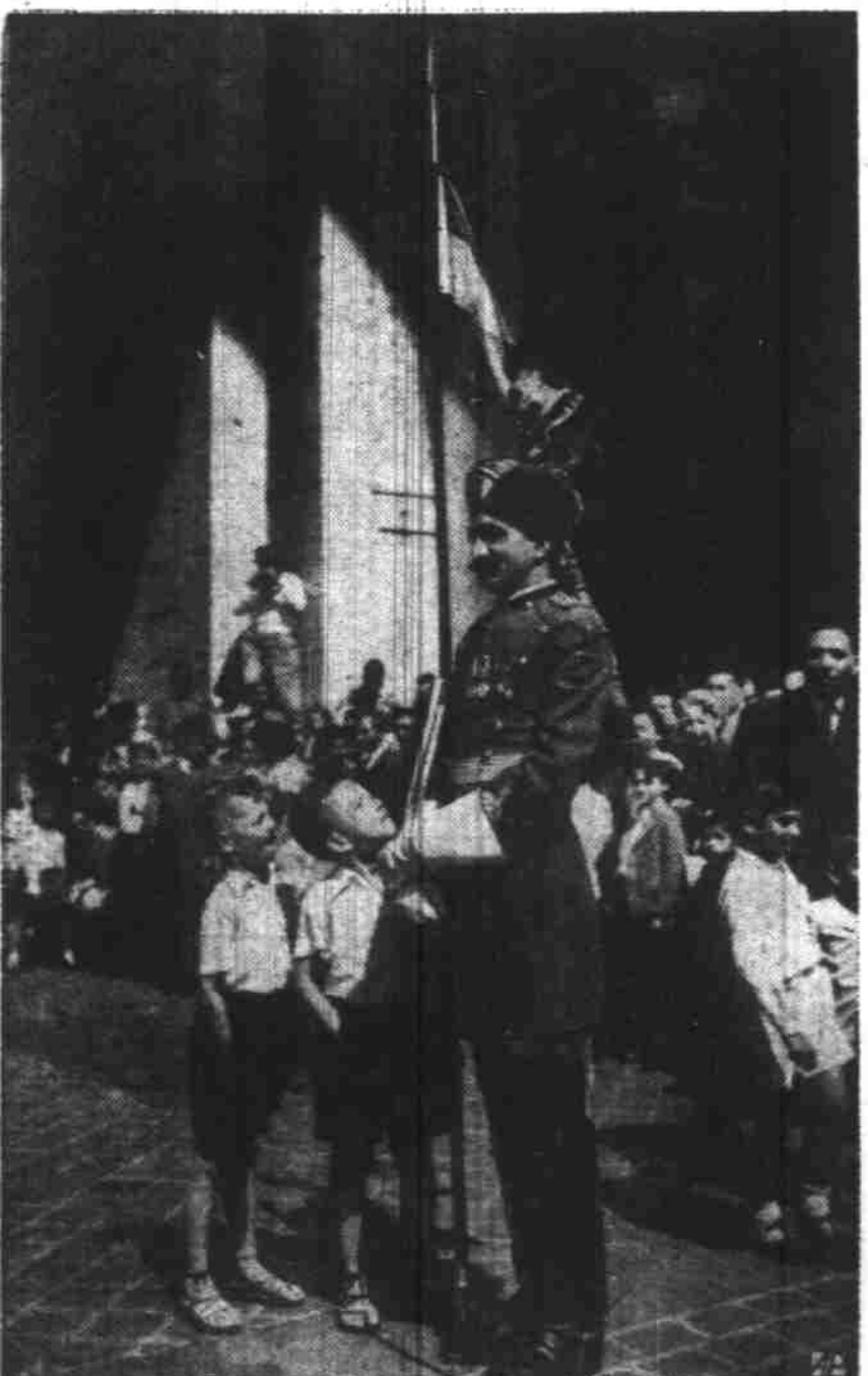
BENGAL LANCER, REALLY! —Paris youngsters see a real, live Bengal Lancer, one of a Pakistani detachment who placed a wreath on Tomb of Unknown Soldier at Arch of Triumph.