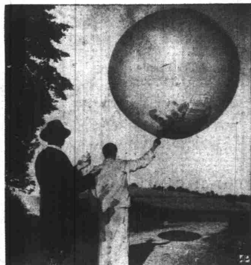
ON 'WINDS OF FREEDOM' —A German student launches a balloon with messages to residents of Soviet-controlled Czechoslovakia, from a secluded farm near Czech border.