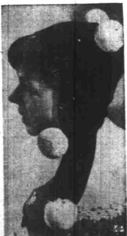
POM-PONS —Knitted hat and accompanying scarf trimmed with pom-poms and worn above a jumper with rows of knitwear flowers, seen at a showing of knitwear in London.