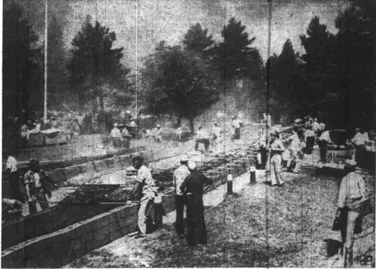
MASS BROIL —A three-shift, 130-man crew at the barbecue pits during State of Maine's annual broiler festival at Belfast, turns out enough chicken to feed 3,000 an hour.