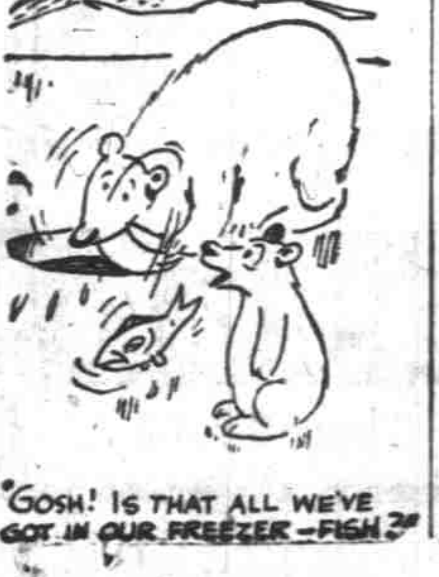
GOSH! IS THAT ALL WE'VE GOT IN OUR FREEZER—FISH!