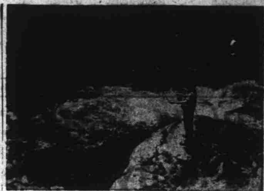
MATCHING WITS AND SKILL against the wily trout in cool coastal or mountain spots is a sport that is luring more women into the ranks of enthusiastic anglers every year.