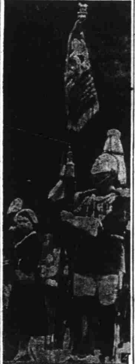
LONDON — Queen Elizabeth II watches formal acceptance of the new colors she has just presented to members of her Royal Household Cavalry in colorful ceremonies at Windsor Castle (Apr. 28). The troop is attached to the royal household for ceremonial duties.