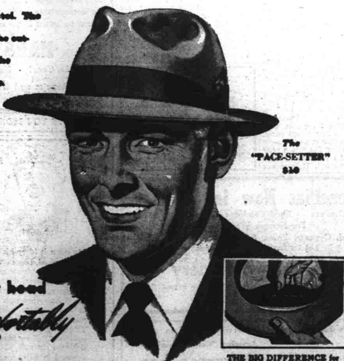
The "FACE-SETTER" $20

No other hat can give such instant comfort as a smart Resistol. The secret is on the "interior" . . . the outside speaks for itself. It's the most comfortable hat made.