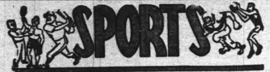
6—The Statesman, Salem, Oregon, Saturday, March 21, 1953