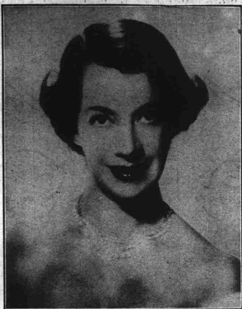
Lily Pons, world's most famous coloratura soprano, who appears on the stage of the Salem High School Auditorium Tuesday night in the Community Concert series of programs.

There will be no meeting of the Salem Council of Women's Organizations in March. The next council meeting is slated for April 18.