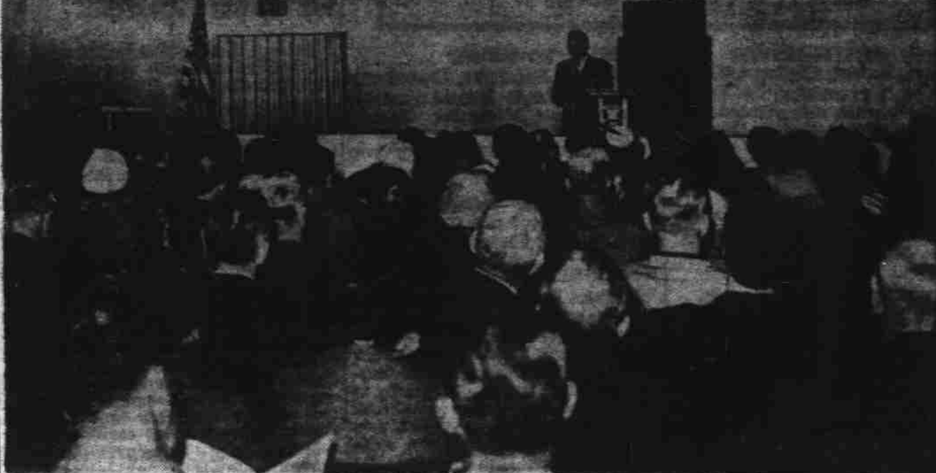
A Statesman-sponsored Investments School drew an overflow crowd, part of it pictured above, Monday night at the Marion Hotel. Speakers, experts in the investment field, will conclude the special two-session school Wednesday at 8 p.m. in the hotel, with the public welcome.