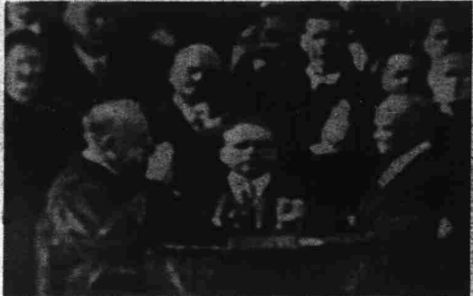
At 9:31 a. m. Salem time Tuesday, television brought to mid-valley residents this historic picture of Gen. Dwight Eisenhower (right) being sworn in as President of the United States by Chief Justice Fred M. Vinson.