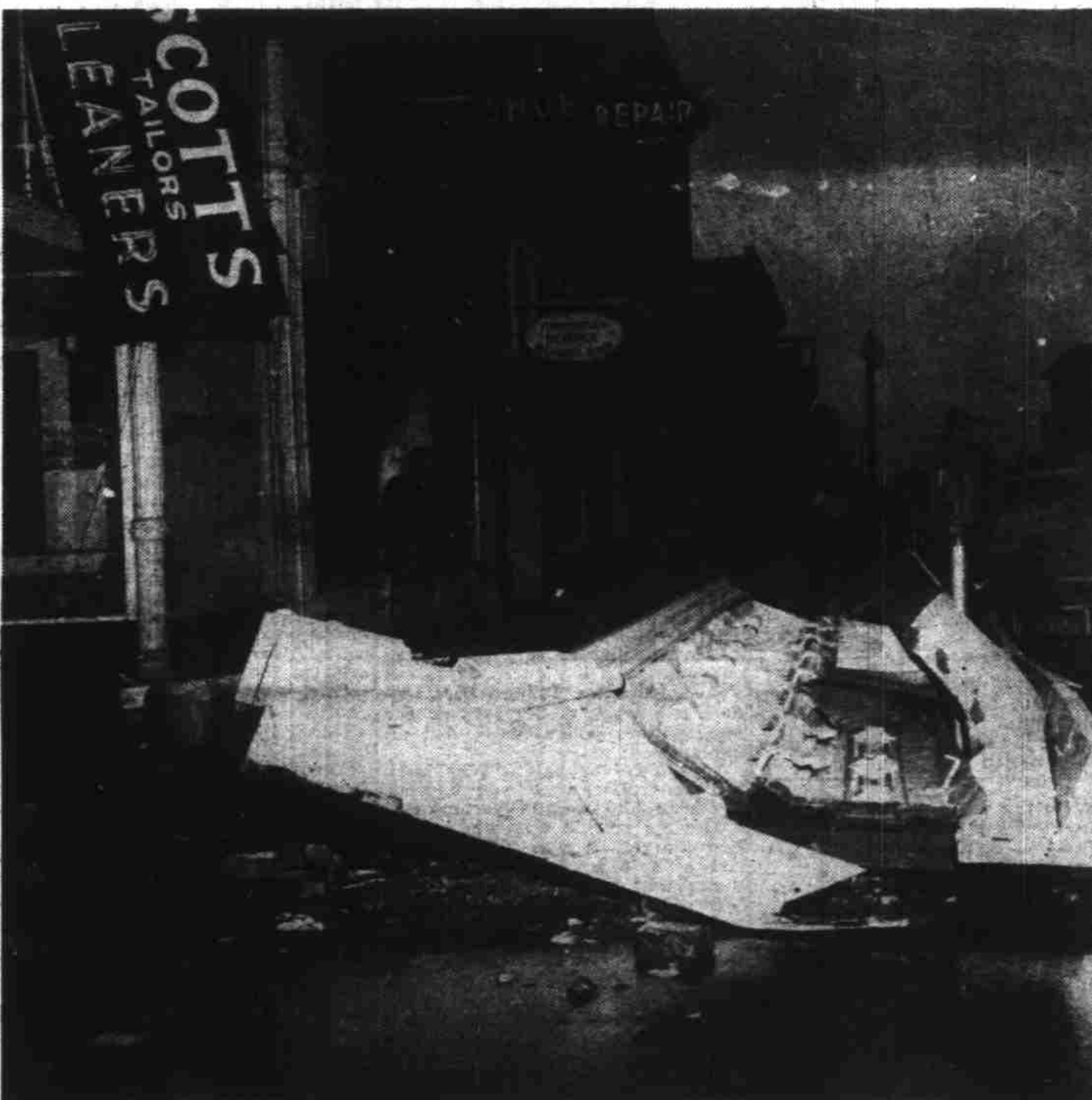
CORVALLIS—Tornado winds ripped through Corvallis at 8 a.m. Tuesday, leaving a trail of battered business buildings. Worst damage was reported at Scott's Cleaners (above) where the marquee crashed into the street when the roof blew away. Damage on Second Street, which caught the brunt of the blow, was estimated at $100,000. Heavy rain deluged much of the valley at the same time, and the same winds apparently struck Pringle minutes later, uprooting trees and poles.