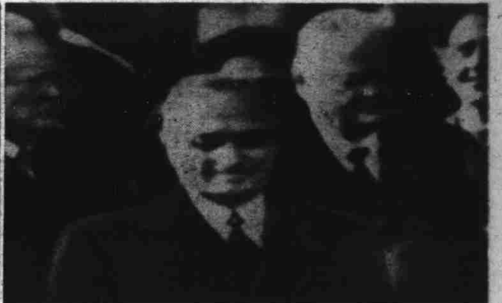
The United States now has two ex-presidents for the first time in many years. In the center is Harry Truman and to the right is Herbert Hoover, president 1928-1932.