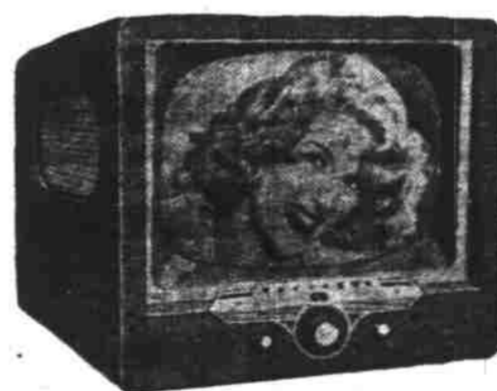
17" Leatherette Table Model VHF-UHF Channels $249 95

Everyone wants their new Raytheon installed by Christmas. We promise, in the name of Old Saint Nick, we'll make it! Our boys have volunteered to work all Christmas day—if need be—to be sure you have yours.