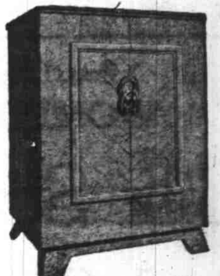
The "Continental" Stockholm Model C-2115 21" $499 95