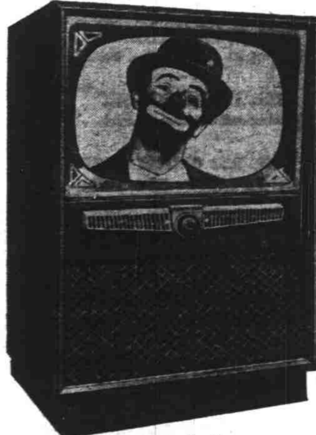
The "Suburban" Montclair Model C-2109 $389 95