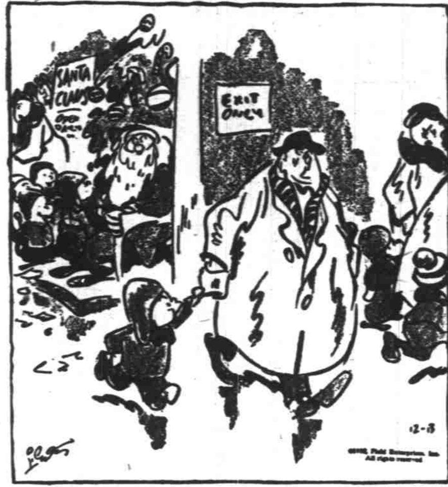
"He promised me everything, Pop!... I thought you said all that would stop after election..."

Associated Press (The Associated Press is entitled exclusively to the use for republication of all local news printed in this newspaper.)