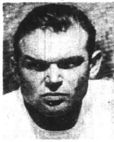
FOREST EVASHEVSKI His Iowa Frosh Terrible