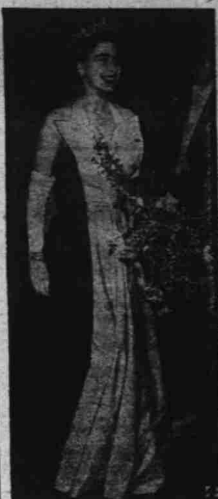
STEPPING OUT—Queen Elizabeth II appears to have enjoyed the show as she leaves London's Empire Theater after a royal film showing and stage presentation.