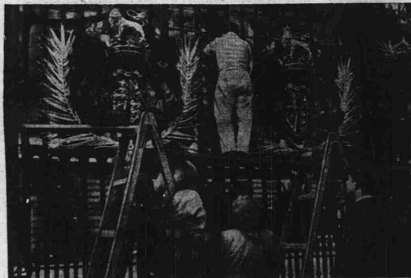
SPLENDOR FOR PALACE —American GPs and others admire work of regilding with 22-carat gold leaf the royal coat of arms on center gateway at London's Buckingham Palace.