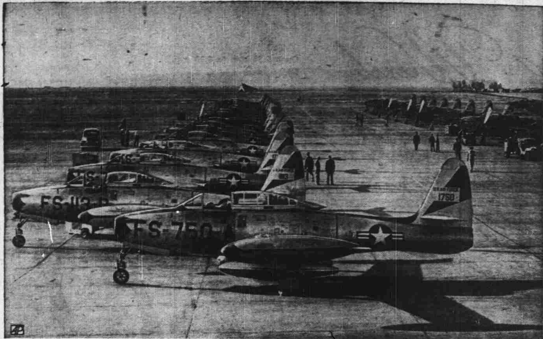
READY FOR FLIGHT TO KOREA — F-84 Thunderjets of 27th Fighter-Escort Wing are lined up at Travis Air Force Base, Calif., for hop to Korea via Hawaii to relieve 31st Wing which made first trans-Pacific mass jet flight in July.