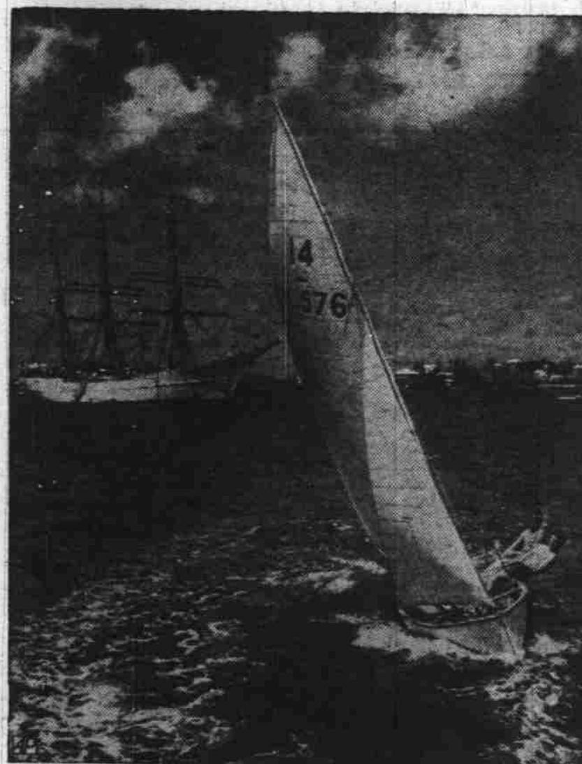
THE YEARS BETWEEN — Two eras of sailing are shown as racing dinghy passes three-masted barque "Eagle," U. S. Coast Guard's training ship in Bermuda's Hamilton harbor.

TOYS BRING HEADACHES MANILA (P)—The Philippines banned the importation of all foreign toys last year except rubber balls but the plan seems to have flopped. Local toy-makers are complaining that cheaper and better quality toys, mostly from Japan and the United States, are still flooding the local market. The local manufacturers called on the government to tighten import controls.