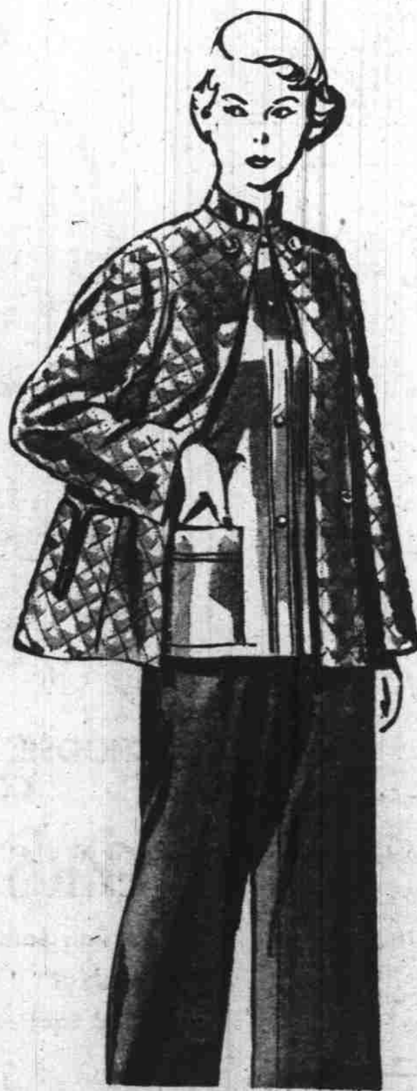
THREE-PIECE PAJAMA SET

The Quisenberry Pharmacies that operate as one! THE QUISENBERRY CORNER COURT & COMMERCIAL Phone 3-9223 MEDICAL CENTER BRANCH 348 COMM. ST. Phone 3-4111