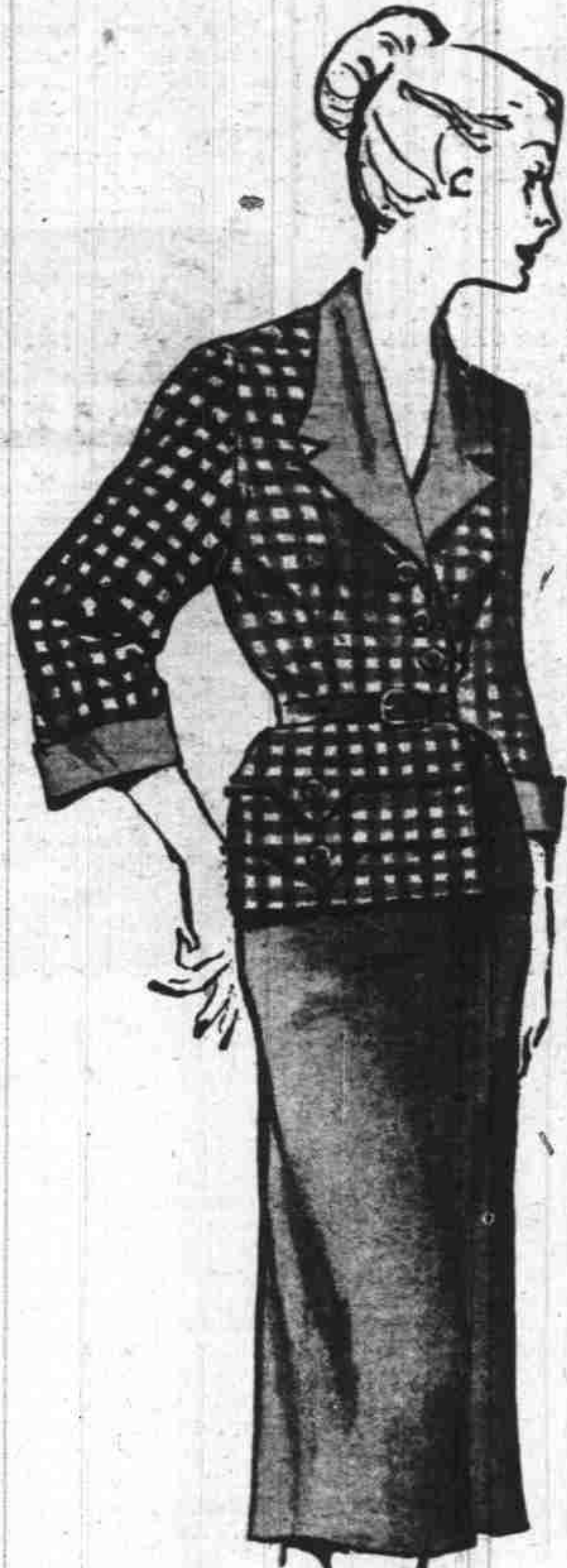
TWO-PIECE SUIT DRESS