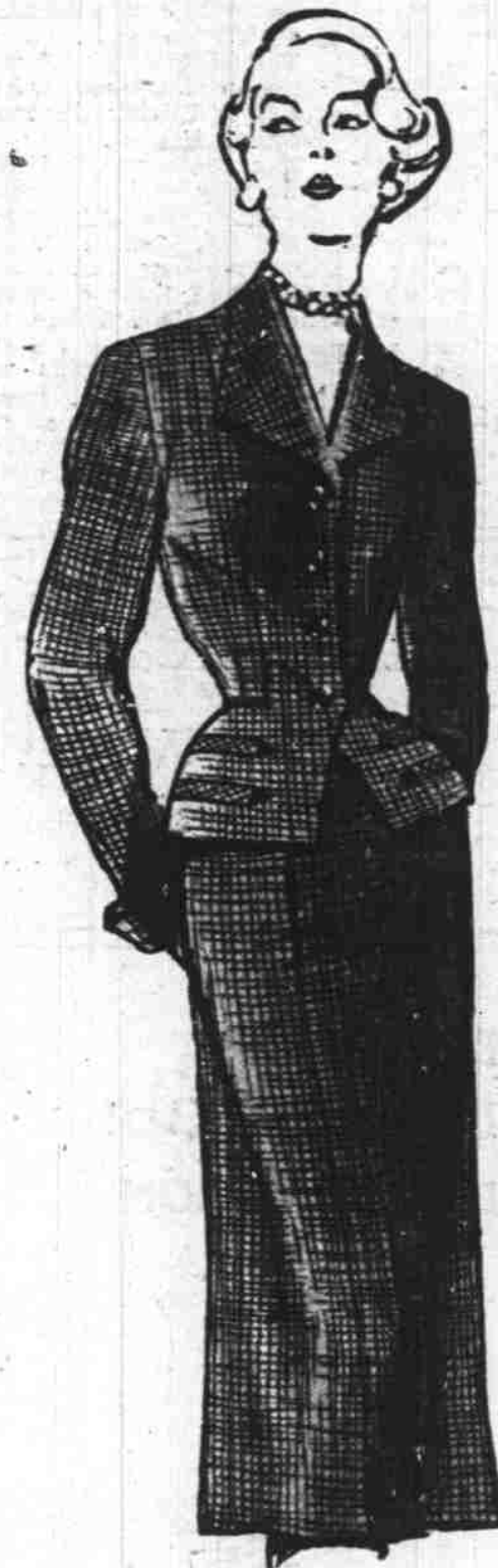
REGULAR 16.98 SUITS ON SALE 3 DAYS ONLY

It's especially designed to flatter and to fit the more mature figure. Solid color skirt with smart checked jacket. Sturdy acetate-rayon fabric that looks smart, wears well, keeps its fresh appearance.