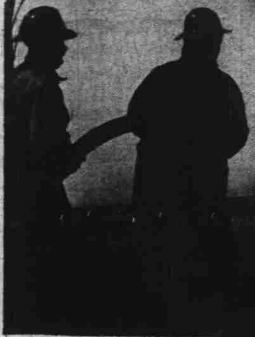
An unexpected dismantling by fire was rendered a shed Wednesday morning at the State Penitentiary annex when fire, believed caused by spontaneous combustion, destroyed a frame building used for storage. The building was to have been torn down and replaced in the near future. All valuable farm equipment was removed and the only known loss was some handcraft equipment belonging to inmates.