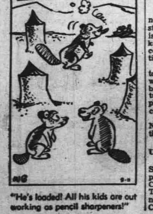
"He's loaded! All his kids are out working as pencil sharpeners!"