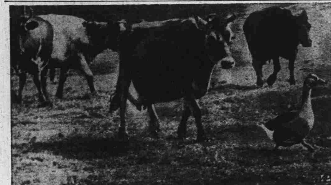
ROUNDUP LEADER — Elizabeth the goose waddles out to pasture at milking time and, after a few squawks to line up the cows, leads them to Les Irwin's dairy farm, Sydney, Australia.