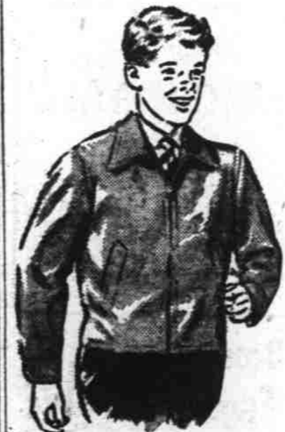
Lined Cotton Poplin Boys' Jacket 3.98

Jr. Sizes . . . . . 1.19 Boyville Jr. long-sleeved knit shirts. Full combed cotton, assorted patterns.