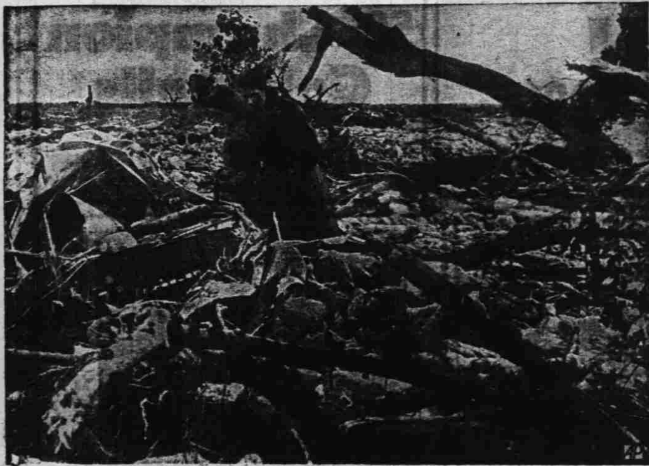
LYMOUTH, England—Britishers look at wreckage of an auto amid boulders and uprooted trees at coastal resort of Lymouth, England, following flash flood which wrecked or swept out to sea nearly the entire village. In center background can be seen wreckage of another auto also swept away when torrential rains on Aug. 15 caused the West Lyn river to burst its banks and race through Lymouth streets leaving a trail of havoc.