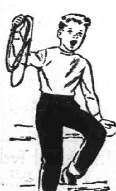
Roy Rogers Denim Blue Jeans 2.25

Boyville water-repellent utility jackets, washfast colors. 2 slash pockets, zipper front. 2 colors, sizes 4-18.