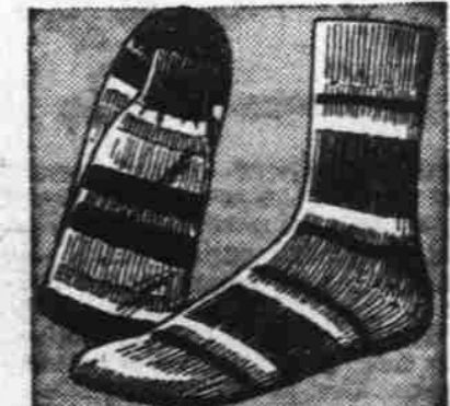
Boys' Hosiery A Sears 4-Star Feature!

Sizes 10-18 . . . . . 1.79 Boyville plaids and fancies, washfast and Sanforized (Max. shrinkage 1%). Lined loop-closing convertible collar.