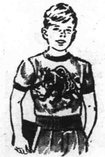
Colorful Cotton Knit Pullovers 1.00

Boyville Jr. thickset corduroy button-on suspender pants. Brown or blue. Pleated front, zipper fly. Sizes 3-10.