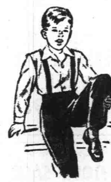
Buckshot-Patterned Corduroys 3.49

Boys' western-cut jeans. Yoke back, zipper fly front, 5 pockets. Double-stitched seams. Roy's signature emblem. 4-16.