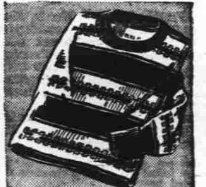
Knit Sport Shirts Ribbed Crew Neck and Cuffs

Boyville Jr. . . . . 1.79 Your young gentleman will love these colorful cotton coat sweaters in doe, campfire, and geometric designs! 4-12.