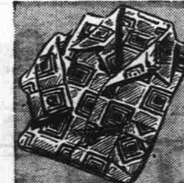
Flannel Shirts Smart Printed Cotton Flannel

Sizes 4-10 . . . . . 1.59 Smart Boyville Jr. sport shirts. Loop-closing convertible collar, 1 pocket. Washfast plaids. *Max. shrinkage 1%.