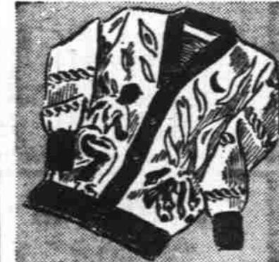
Jr. Coat Sweaters Smart Jacquard Knit Designs

Boyville Jr. . . . . 1.79 Your young gentleman will love these colorful cotton coat sweaters in doe, campfire, and geometric designs! 4-12.