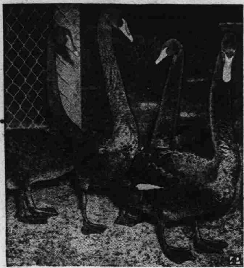
FOR CHURCHILL —Four black swans from Australia's South Perth Zoo are enroute to Winston Churchill to replace others killed by marauding foxes on the British Premier's estate.