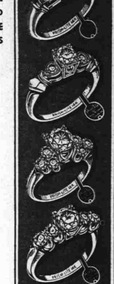
ILLUSTRATION ENLARGED TO SHOW DETAIL

SALEM'S LEADING CREDIT JEWELERS AND OPTICIANS