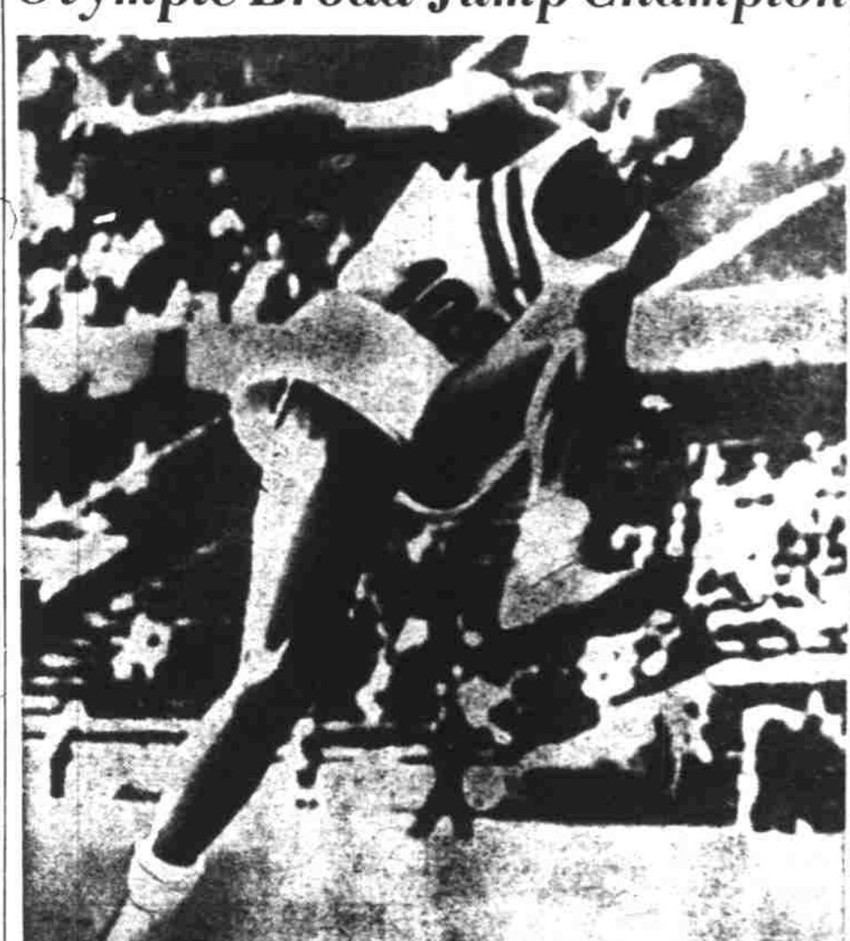
HELSINKI-Jerome Biffle of the U.S. Army and formerly from Denver, takes off during the broad jump in the Olympic Games. Biffle took the event for the United States with a jump of 24 feet, 10.03 Chuck Logg Jr. and Tom Price, inches.