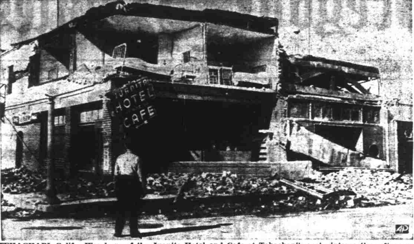
TEHACHAPI, Calif.-Wreckage of the Juanita Hotel and Cafe at Tehachapi's main intersection after recent earthquake in Southern California interior, second most severe in the last half century. At least one victim was found in this hotel, as searchers still comb the wreckage.