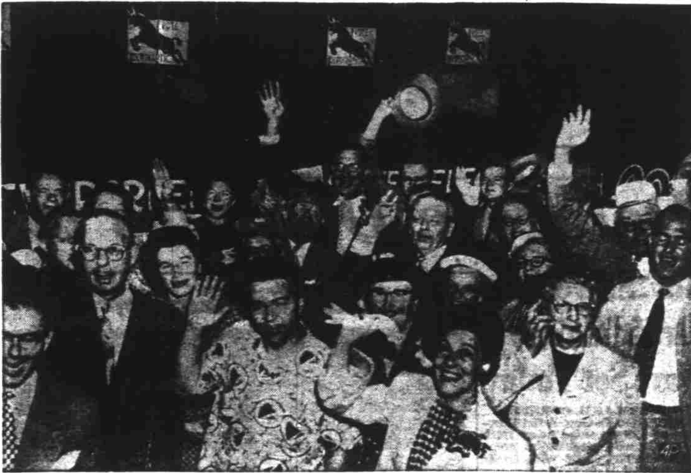
CHICAGO—Delegates from the state of Washington, piling off the train at Union station, find Sen. Estes Kefauver (rear-far left, center) avowed candidate for the Democratic presidential nomination, right there to greet them as they arrived in Chicago. The delegates and Kefauver were swept right along in a dash to the Democratic headquarters hotel. (AP Wirephoto to The Statesman.)