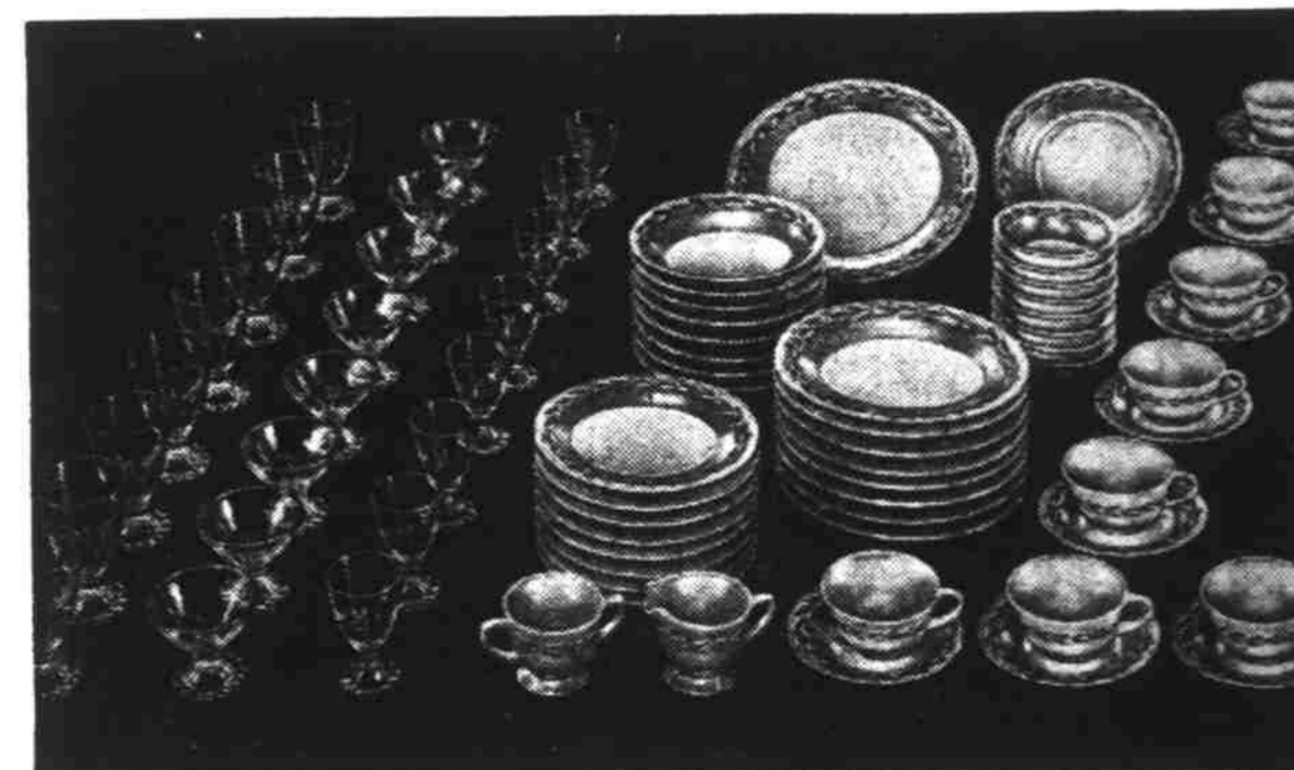
● Each Glass Attractively Initialed ● Smart New Heatproof Fire-King Dinnerware

Come in today and see this charming, 76-piece set! (This gift offer applies to ANY 9 cu. ft., 11 cu. ft., or DUAL-TEMP Model.)