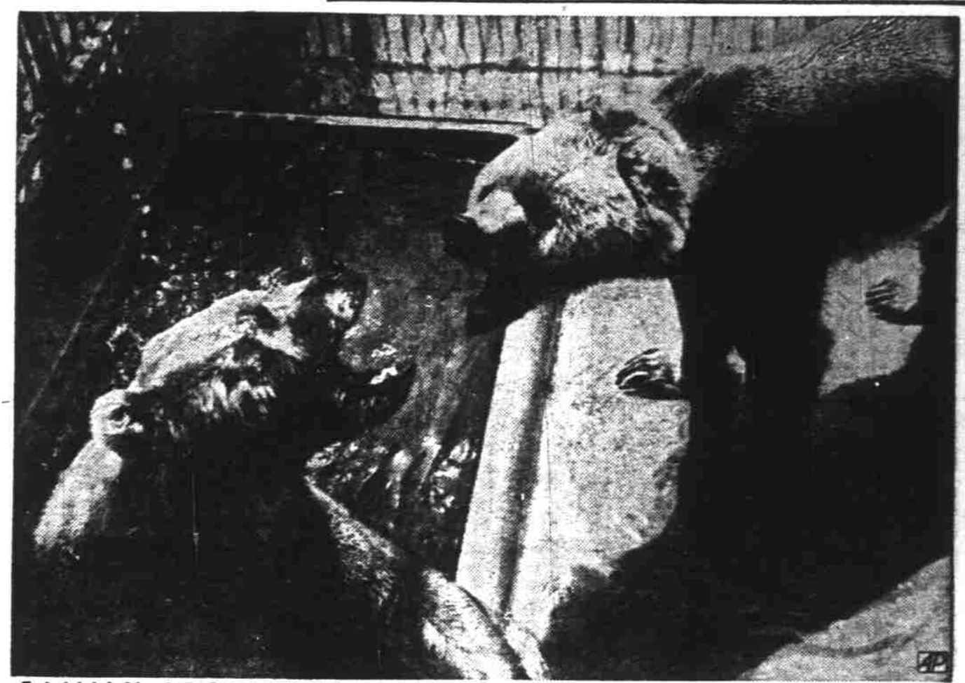
FAMILY ARGUMENT—Richard, male member of the Kodiak bear family at the New Orleans Audubon Park Zoo, tells his male, Lou, to find her own pool of water to keep cool.

PARIS (P)—Charles Humez of Paris scored a technical knockout over Tony Janiro of Youngstown, Ohio, Monday night as Janiro's handlers threw in the towel at the start of the fifth round.