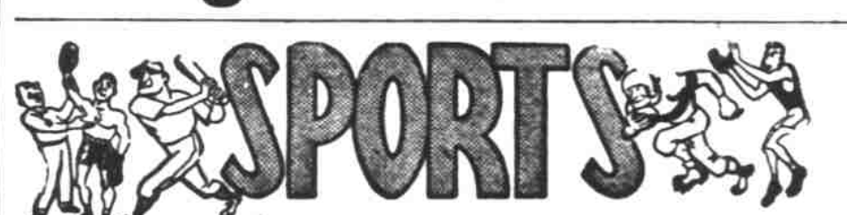
14—The Statesman, Salem, Oregon, Friday, June 20, 1952