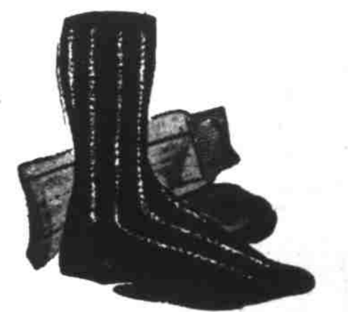
"Phoenix" Rayon Sox