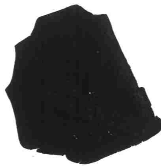
Gabardine Sport Shirt

WE RESERVE THE RIGHT TO LIMIT QUANTITIES