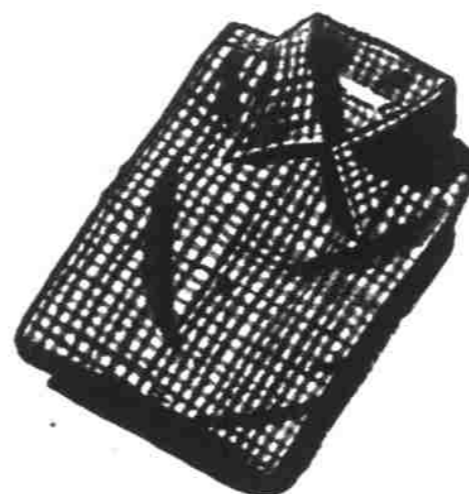
Orlon & Nylon Shirt