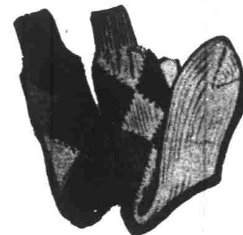
Cotton Argyle Sox