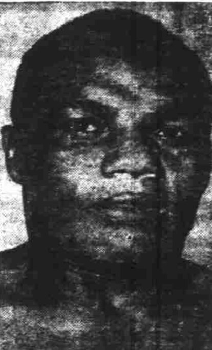
JERRY JOE WALCOTT Again wins over Charles.

PHILADELPHIA (AP)—Jersey Joe Walcott, 38-year-old Cinderella man of the ring, clung to his world heavyweight boxing title Thursday night by wining an unanimous decision over ex-champ Ezzard Charles.