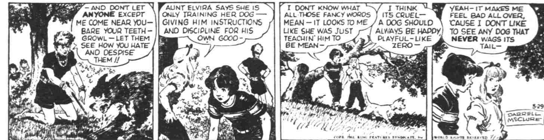
LITTLE ANNIE ROONEY