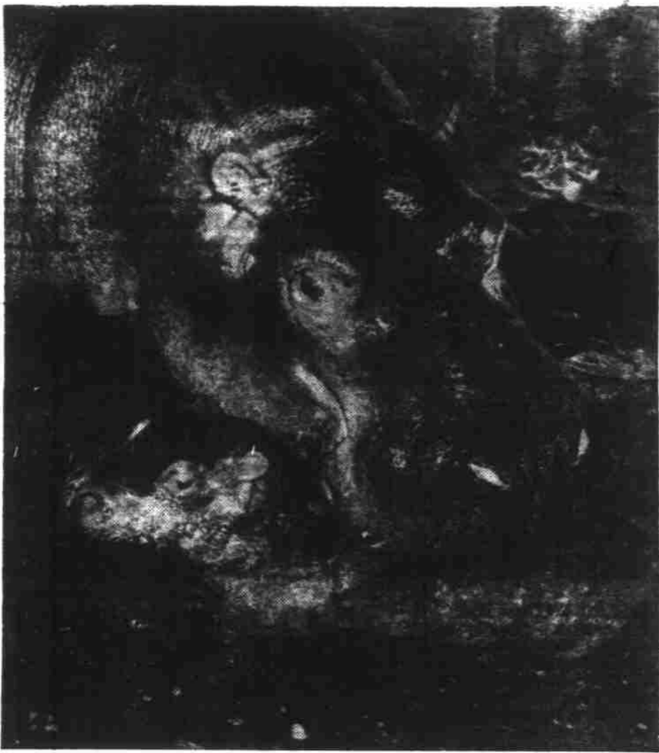
FRANKFURT, Germany—Baby daughter takes a swimming lesson under the watchful eye of mama hippo at Frankfurt zoo in Germany. The youngster, now three-weeks old and a healthy 120 pounds, is the first hippo ever born at the Frankfurt zoo. It has doubled in weight since birth and gives promise of becoming a pretty big girl like her mom.