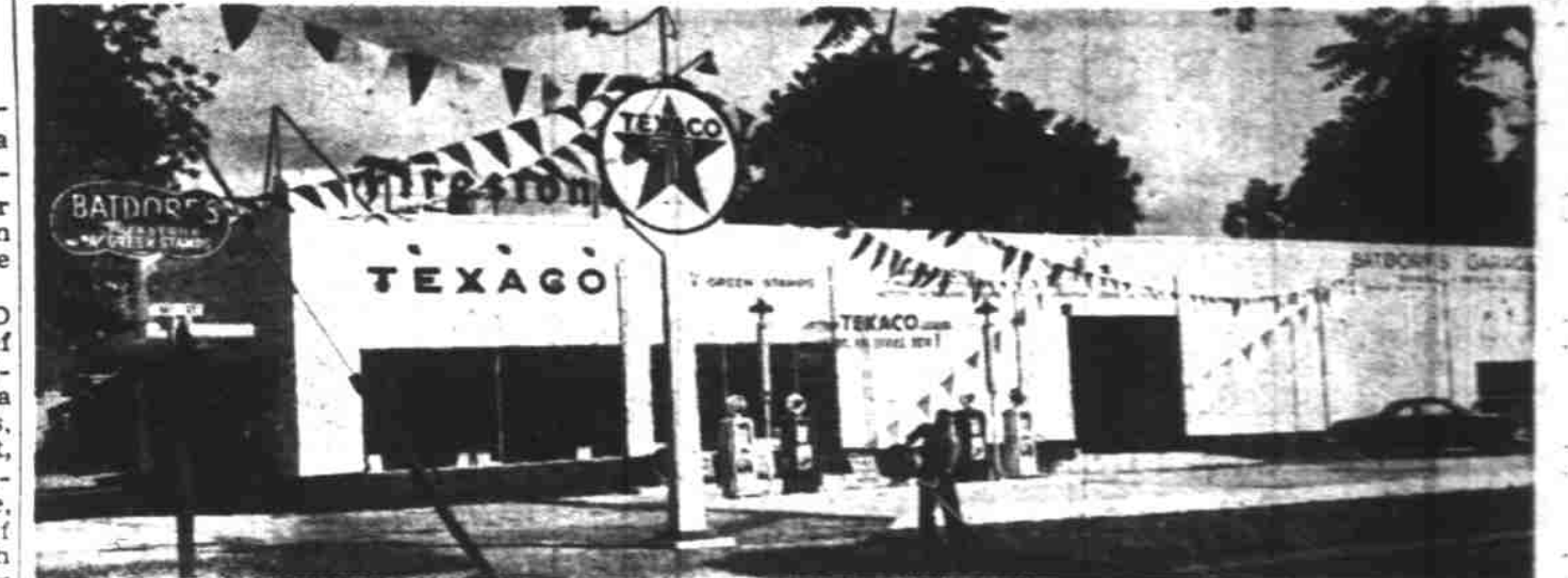
This new Batdorf store at 14th and State Streets is open for business. A three-day open house, which began Thursday, showed customers the automotive and home appliance features of the new store. The business includes the outside gas pumps and automobile service department.