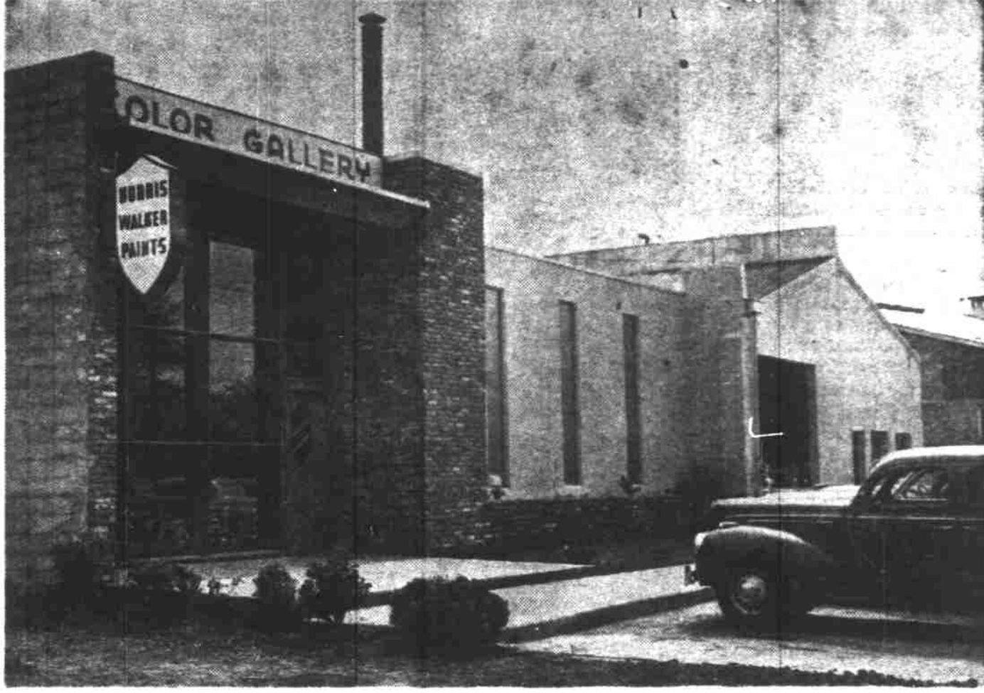
Factory and retail operations are combined now for Norris-Walker Paints which has completed its new building on North Front Street. Aim of the modern color gallery is to give home owners a homelike background for the selection of paints for decorating their homes. The company, started here in 1946, manufactures most of the paints sold in its new store.