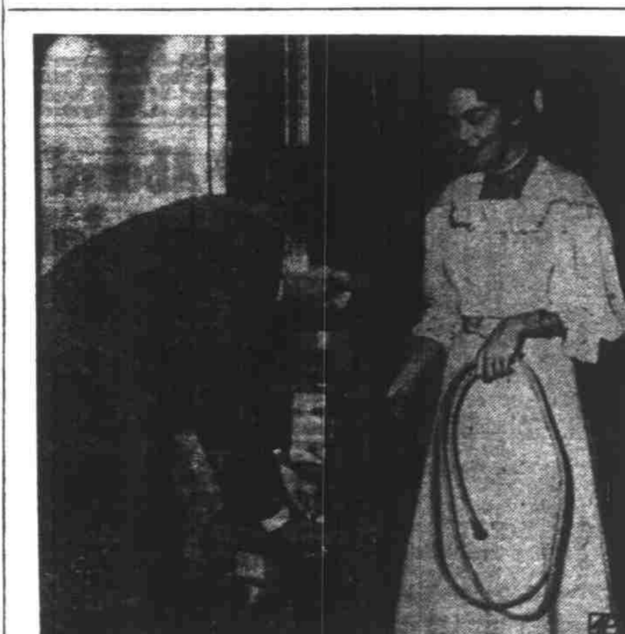
DRAWING ONE —Will Rogers, Jr., playing role of his famous humorist father in a Hollywood movie, draws a drink between scenes for actress Jane Wyman who portrays humorist's wife.