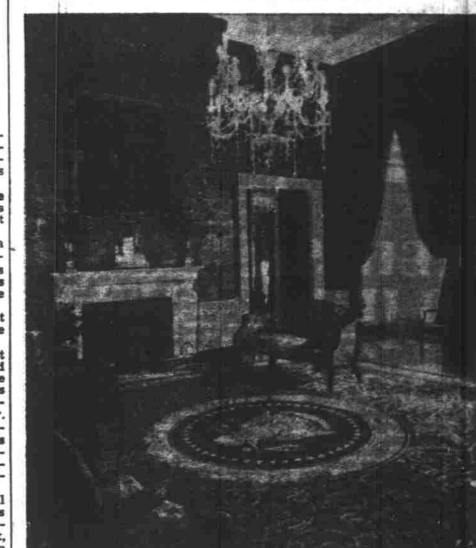
One of the sitting rooms in the newly renovated White House is the Green Room, which features a hand tufted rug—including the seal of the President—which was reproduced from an old Aubusson rug which was originally used here but now is too frail for use. Walls and draperies are of silk damask. All old pieces of furniture have been restored and refinished.