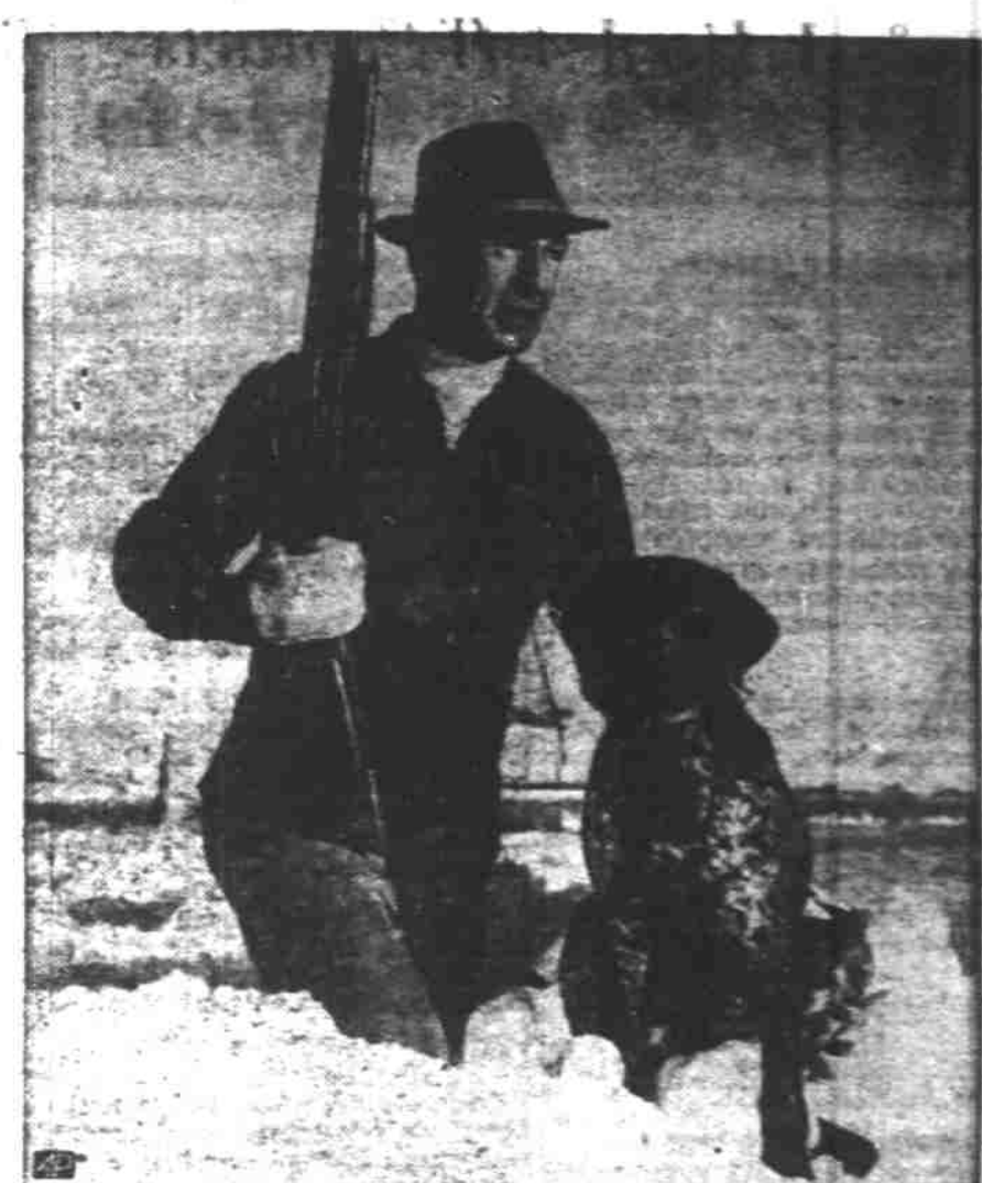
READY ON FIRING LINE—Screen star Gary Cooper takes place with his dog on the firing line during shooting routine for turn at bagging pesky magpies at Sun Valley, Idaho.