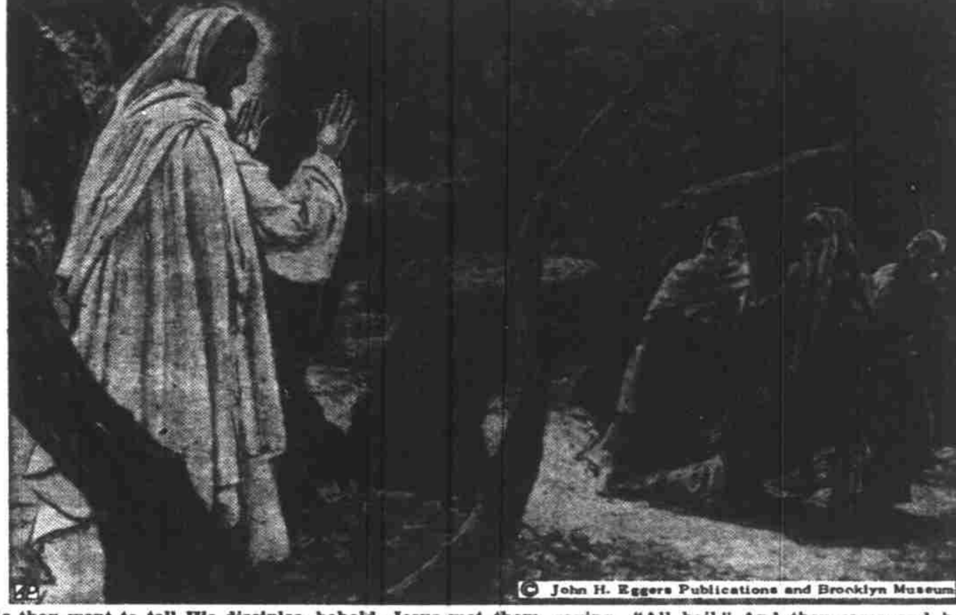
As they went to tell His disciples, behold, Jesus met them, saying, "All hail." And they came and held Him by the feet and worshipped Him.—Matthew 28:9. (Photograph of original painting by J. J. Tissot.)