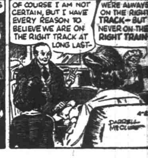
LITTLE ANNIE ROONES