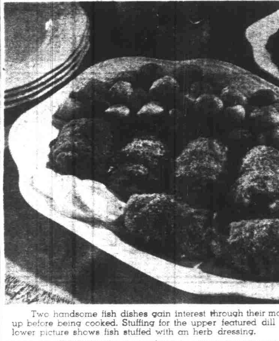
Two handsome fish dishes gain interest through their manner of serving. Both are rolled up before being cooked. Stuffing for the upper featured dill flavor from pickles, while the lower picture shows fish stuffed with an herb dressing.