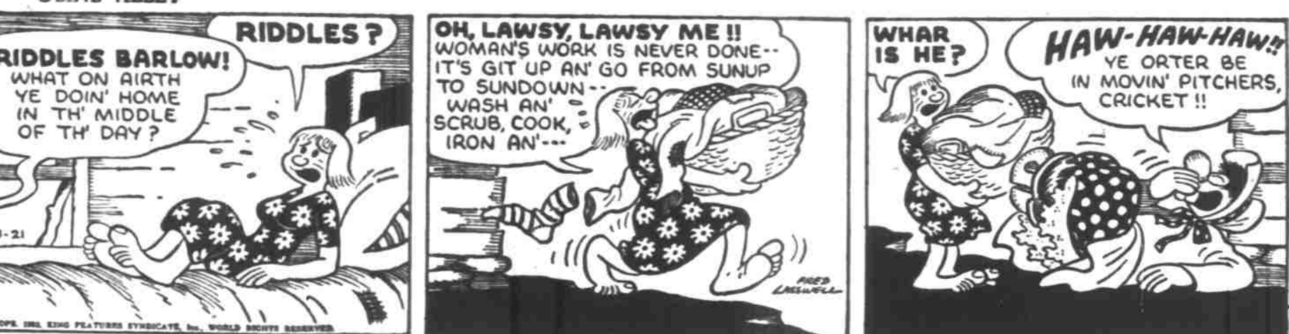
B. BY GOOGLE