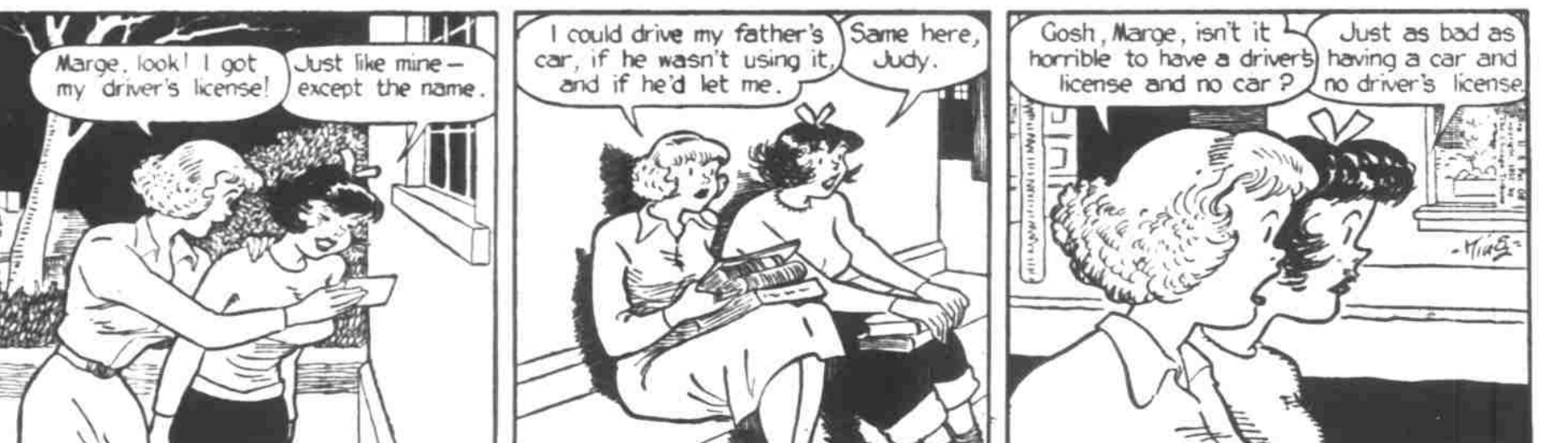
G. GLADYS ALLEY