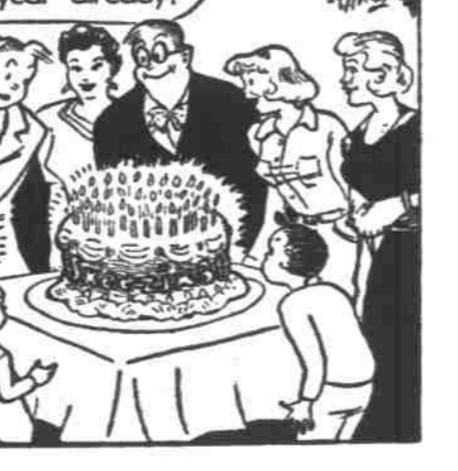
G OLIVE ALLEY