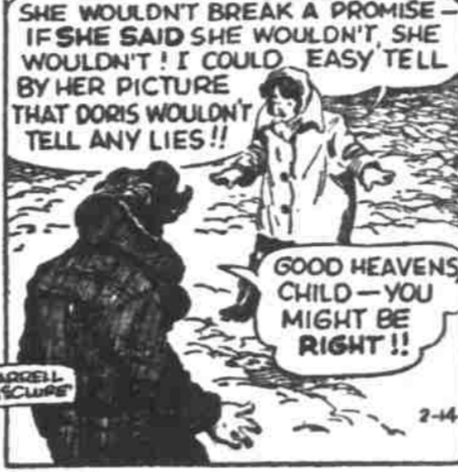
LITTLE ANNIE OUEL