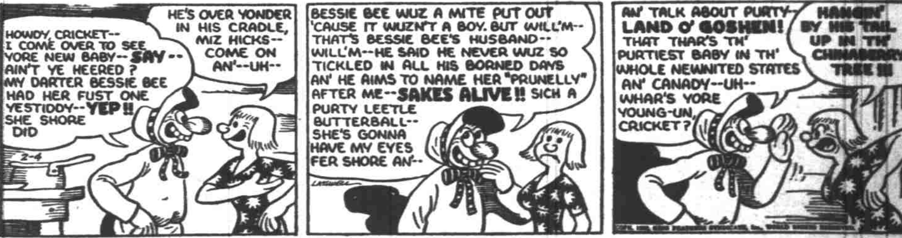
BAANE / GOOGLE