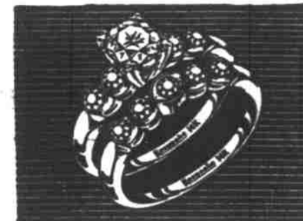
ROANOKE Ring 150.00 Wedding Ring 75.00

Nationally Advertised Names are Your Best Protection!