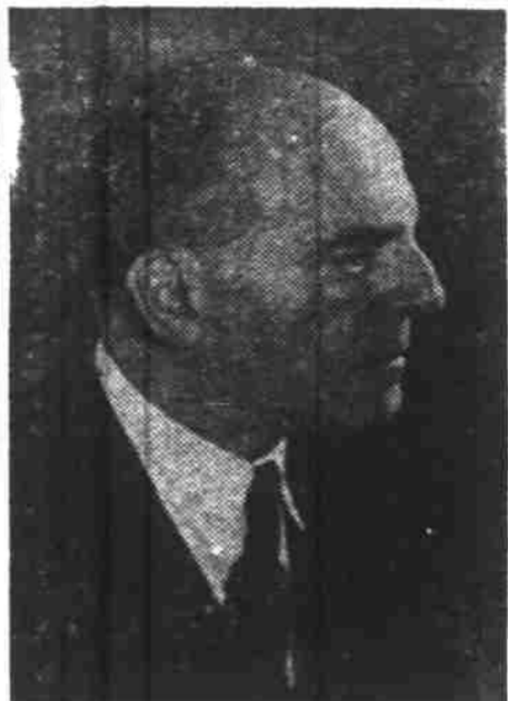
Solomon, distinguished British pianist, who will appear at Salem High School Auditorium on Thursday night, January 17 under the sponsorship of the Willamette University Associated Students. Tickets are still available.

Le Reveur, from "Silhouette" Arensky Orchestra Prophetic Bird Schumann La Ronde des Lutins Bazzani Francescatti