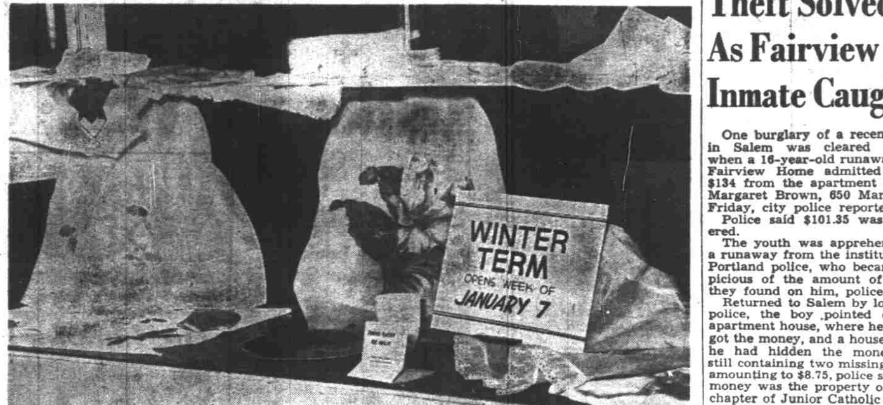
Delicate aprons with hand painted designs now on display at First National Bank in Salem are samples of textile painting created by adult students during the fall term of evening clases. Salem Public Schools will again offer courses in handicrafts, business, homemaking and others in the winter term starting Monday. (Statesman photo.)