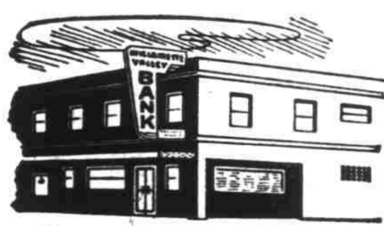
A completely modern banking office