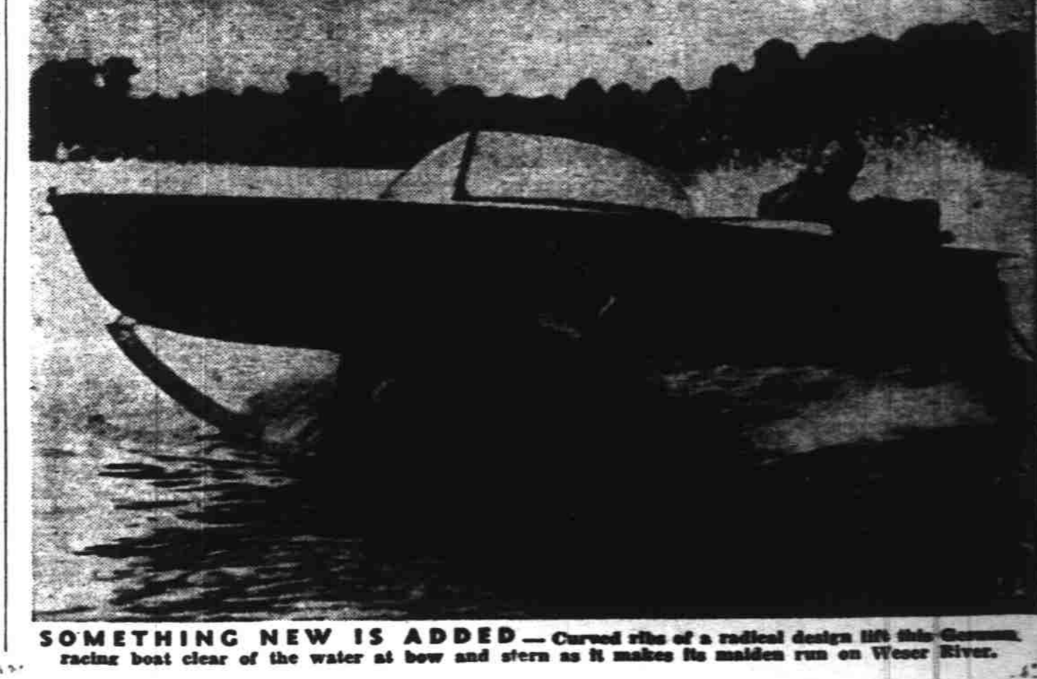
SOMETHING NEW IS ADDED — Curved ribs of a radical design lift this German racing boat clear of the water at bow and stern as it makes its maiden run on Wesser River.