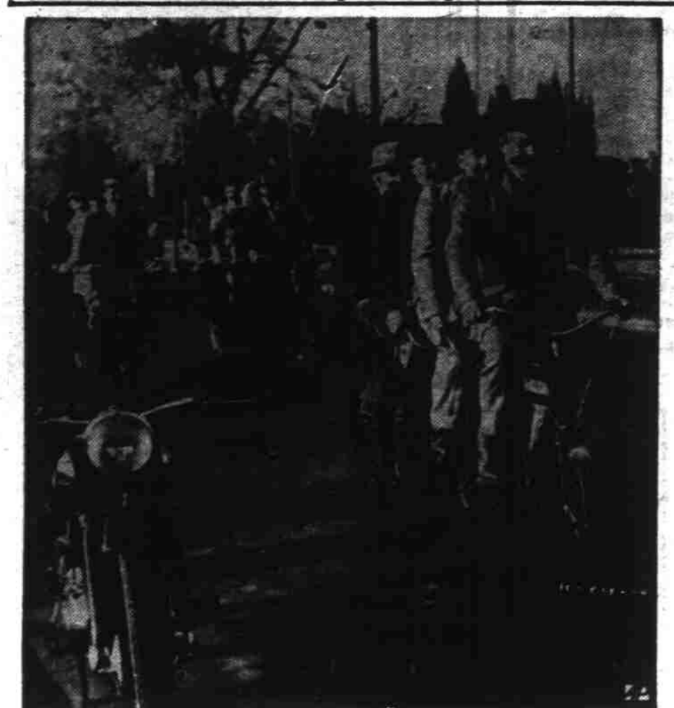
COME TO THE FAIR — Cyclists, dressed in fashions of yesteryear, ride through Frankfurt, Germany, heralding opening of the first International Motorcycle and Bicycle Fair.