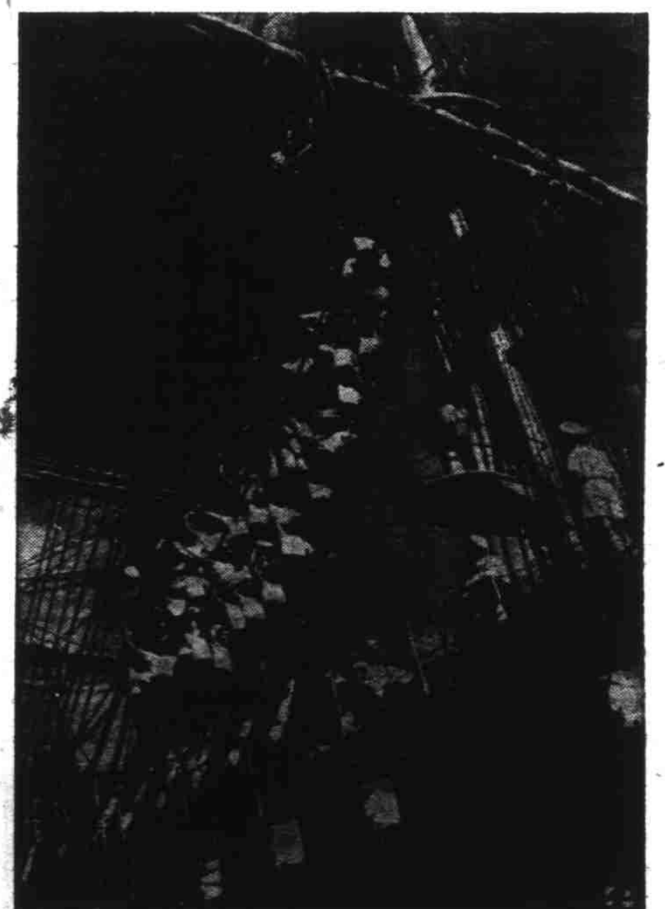
MAKING PORT IN GOTHAM—Italian codets were from the rigging of their trading ship, the 10,000-mile cruise, as they arrive in New York on log of a 10,000-mile cruise.

The balance of the card is to be added later. Owen plans making it as solid as possible, coinciding with the Christmas theme.